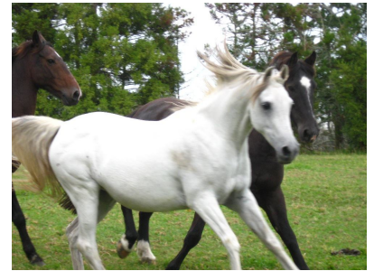
Kizmet my little Arab Horse